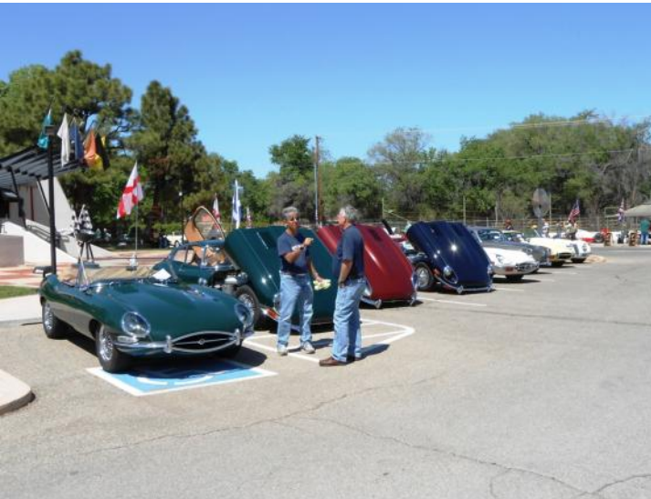
I fixed the bonnet-latch this way.

To See more great pictures from the BAOA British Car Roundup, go to baoa.org !