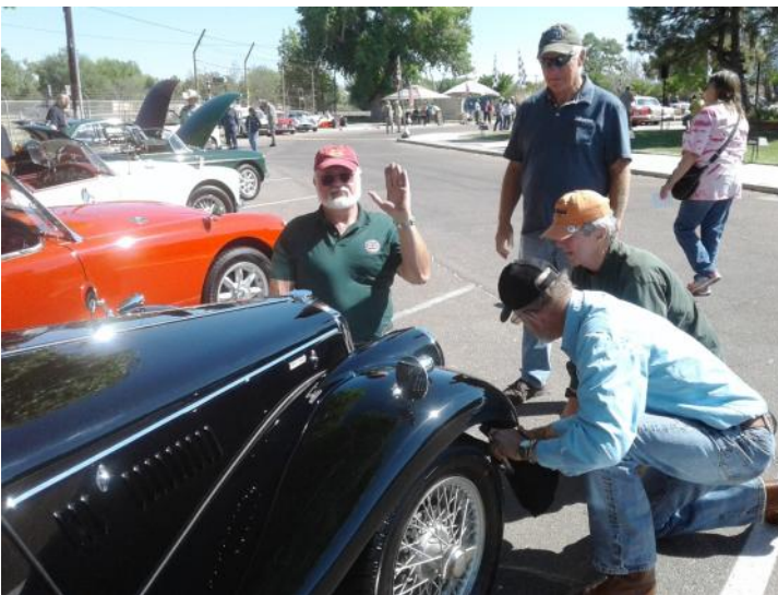
TF front suspension powwow.