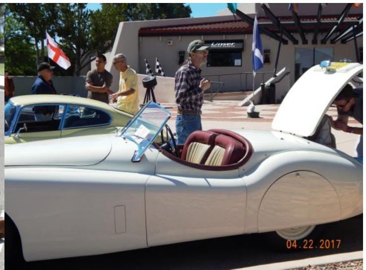
The key's here someplace!