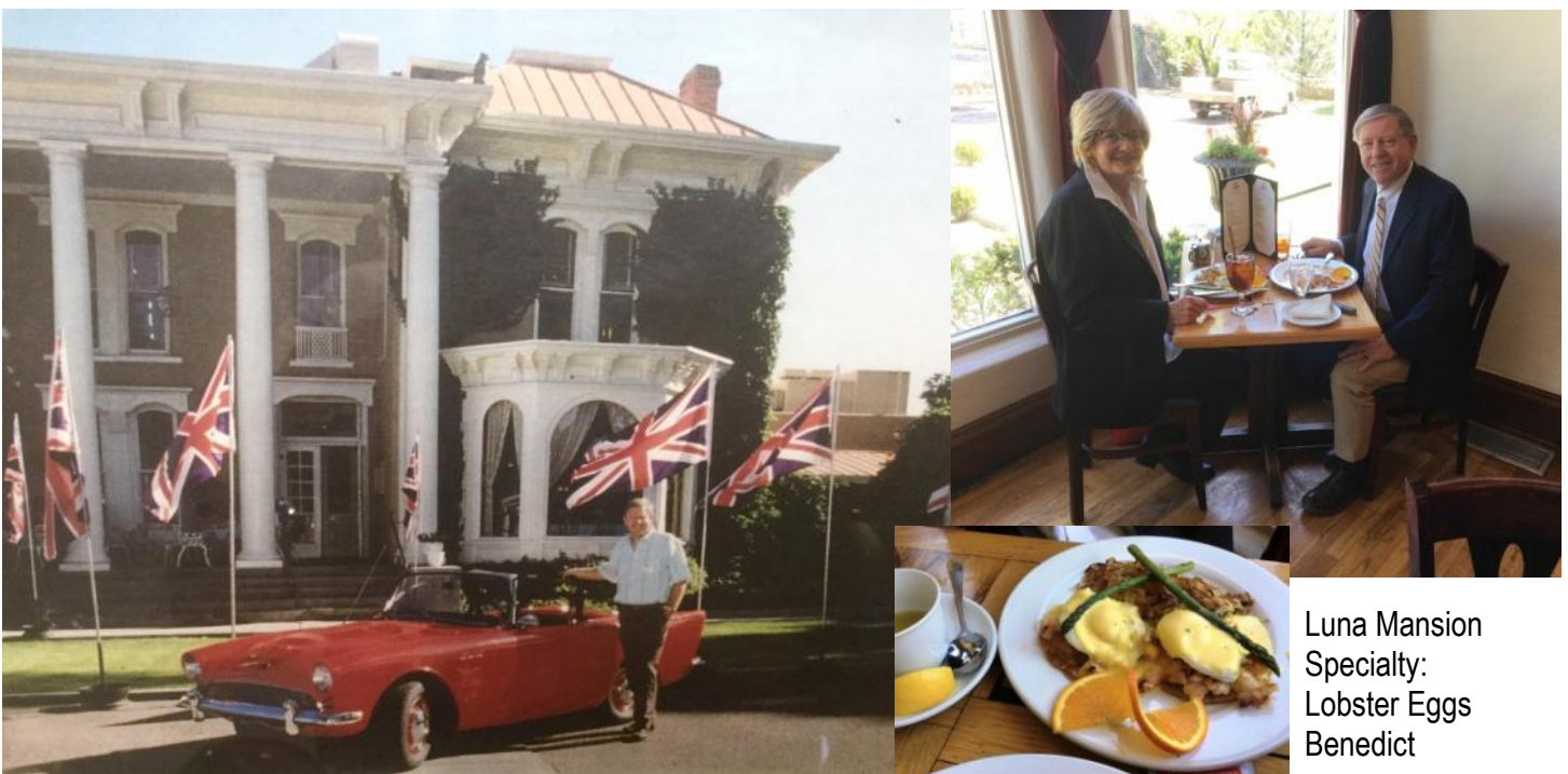
Luna Mansion Specialty: Lobster Eggs Benedict